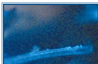
Hot Water Extraction 200 X Particulate residues evident.